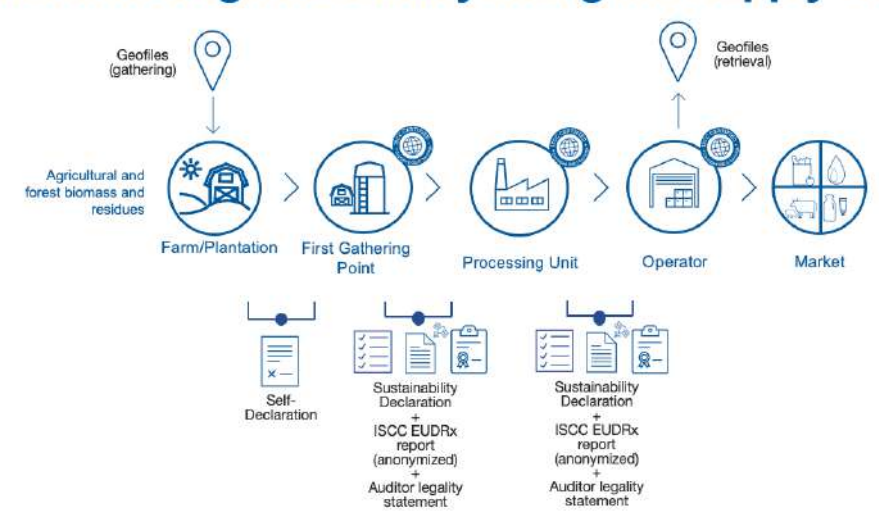
Figure 1: Depiction of the forwarding of information